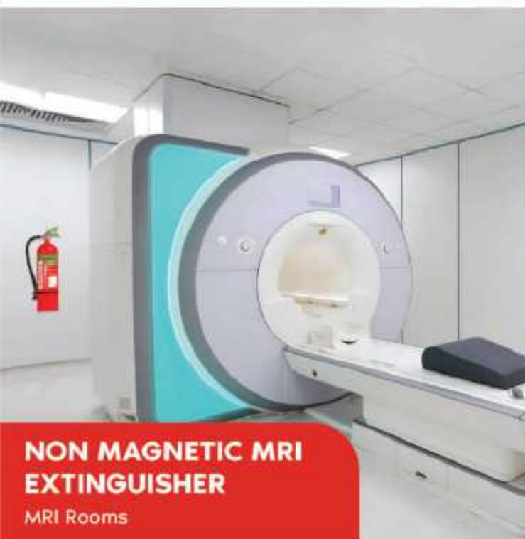
NON MAGNETIC MRI EXTINGUISHER