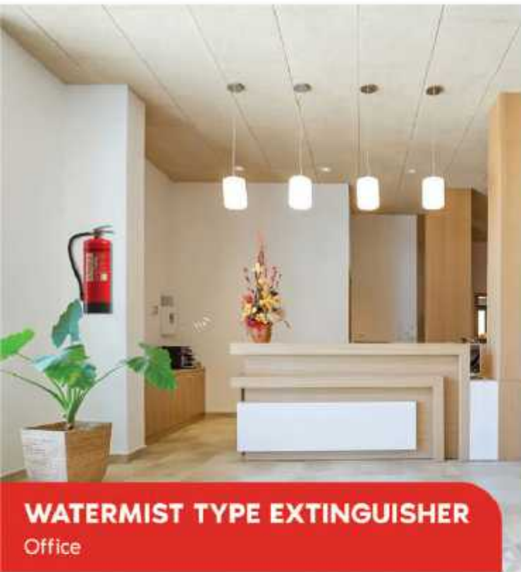
WATERMIST TYPE EXTINGUISHER