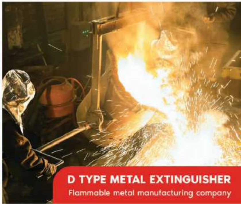
D TYPE METAL EXTINGUISHER