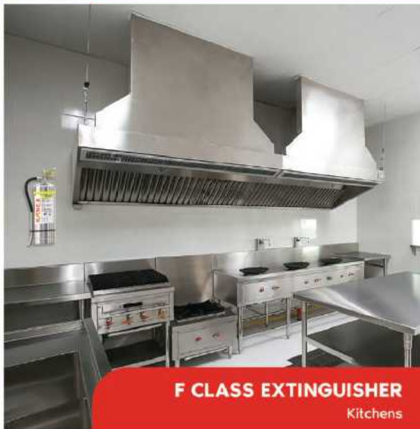
F CLASS EXTINGUISHER